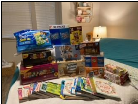
Items Donated by Members